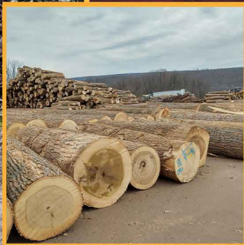
RECORD AND BUILD YOUR OWN LOG INVENTORY

You can also back up your Inventory records via USB , allowing you to store copies of your data without worry. This routine also has a built in function that allows you to clear your inventory records from the handheld, as well as reset the program to it's factory settings. These can be utilized in case of any inventory errors or when beginning a new period of inventory records.