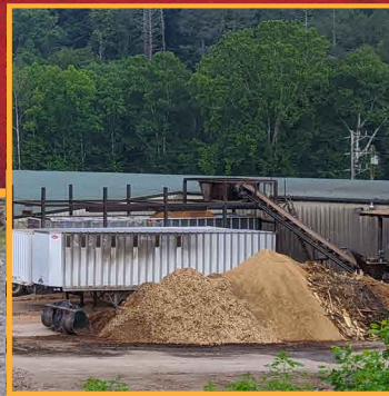
BULK CONSUME UNTAGGED INVENTORY BY FOOTAGE