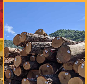
BUILD A COMPLETE TAGGED OR UNTAGGED INVENTORY