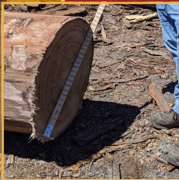
EFFICIENTLY SCALE YOUR INCOMING VENDOR LOADS

Detailed reports included in this routine outline your scaling results, including log counts and total load values. Our Weekly Summary Report shows your total purchase amount for your loads - as well as your species, grades, and footages - sorted by Vendor, Tract, and Trucker. The weekly Check Journal report prints your Vendor and their weekly costs, making Settling a breeze.