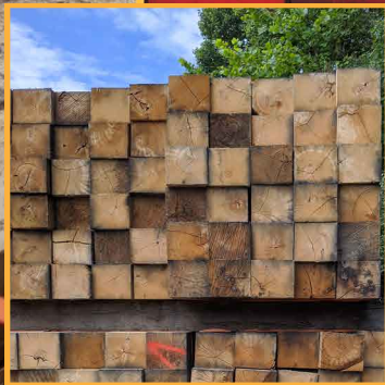
QUICKLY AND EASILY BLOCK TALLY YOUR GREEN LUMBER

These bundles can be used to create green lumber sales , in which you can assign costs to each bundle, as well as shipping charges . This routine can also interface with a Zebra printer so you can produce bundle tags at the time of shipping.