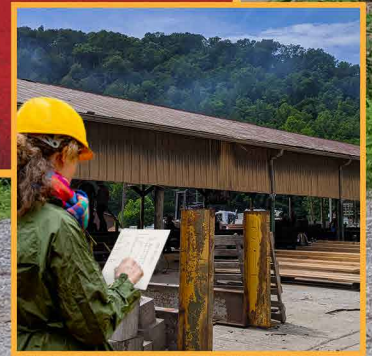
PRINT DAILY REPORTS FOR YOUR SAWMILL CONSUMPTION