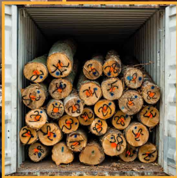
BUILD LOG SHIPMENTS FROM YOUR EXISTING INVENTORY