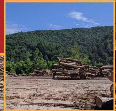
RECALL YOUR MOBILE INVENTORY INSTANTLY