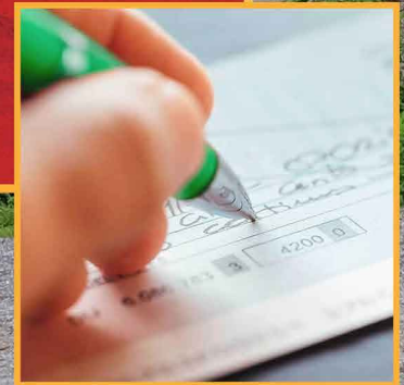
SETTLE LOADS AND GENERATE PAYMENT REPORTS