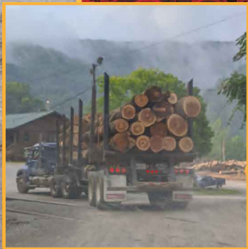
BUILD YOUR OWN VENDOR AND PRICE LISTS

The weekly Check Journal report provides a quick and easy to understand report, detailing each Vendor and their total costs for the week. The Mill Boss™ provides all the info you need to settle - all you need to do is write the check.