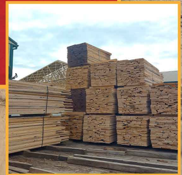
BUILD AND SAVE YOUR LUMBER INVENTORY