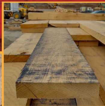
ASSIGN CUSTOM SPECIES AND GRADES