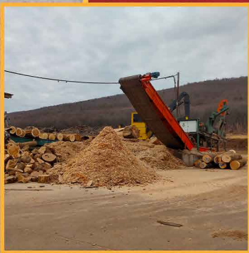
DEplete YOUR EXISTING INVENTORY IN REAL TIME

Your daily consumption is not only recorded, but can be printed from your handheld via our detailed consumption reports. Log lists and summaries are available, containing dates, log counts, total footage, and species and grade information of what was sawn. Get daily production results in an instant .