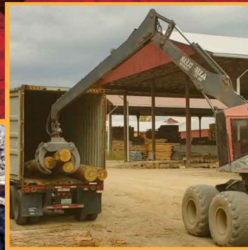
ASSIGN A CUSTOMER AND PRICING TO YOUR SALE