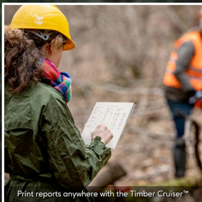
Print reports anywhere with the Timber Cruiser™

When connected using Wi-Fi Direct to our HP200 Mobile Timber Cruiser™ printer, you can produce real time reporting results on the go, wherever you are. Take all of the convenience of the office with you into the woods with this easy-to-use pairing.